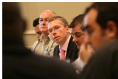
Working on it together...

12 Month Property Investors Mentorship Programme Now taking applications for June 2007 CALL US NOW 0845-838-1947