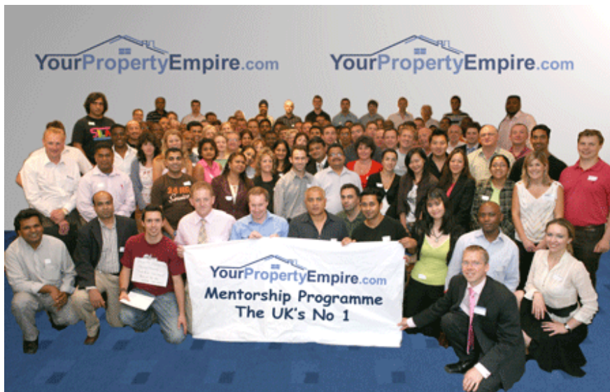
The Mentorship Programme Group Photograph

12 Month Property Investors Mentorship Programme Now taking applications for June 2007 CALL US NOW 0845-838-1947