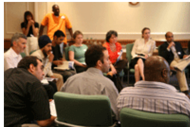
A workshop session...