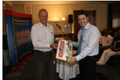
Receiving 'a prize' for doing a great property deal...