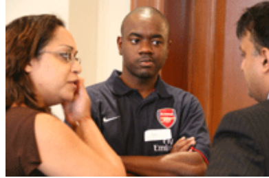
A problem shared...